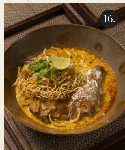
Free Range Chicken in Aromatic Curry Broth with Crispy Egg Noodles