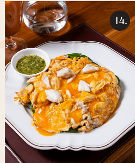
Premium Jumbo Crab Omelette Rice Set with Lump Crab and Runny Duck Eggs