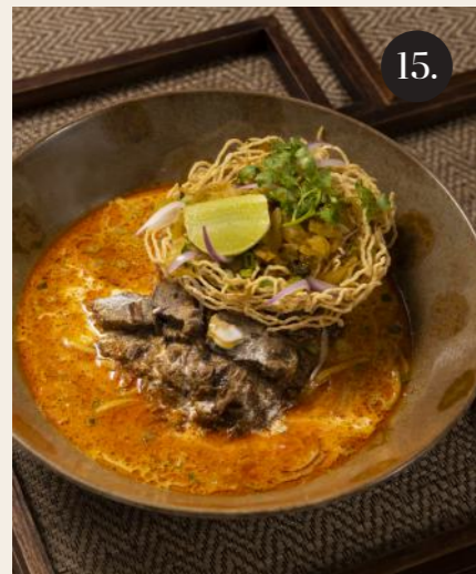
Tender Braised Beef Shank in Aromatic Curry Broth with Crispy Egg Noodles