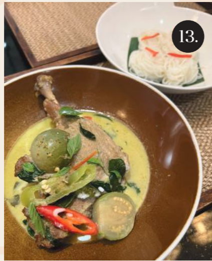
Irish Duck Green Curry with Round Eggplant and Kanom Jeen Rice Noodles